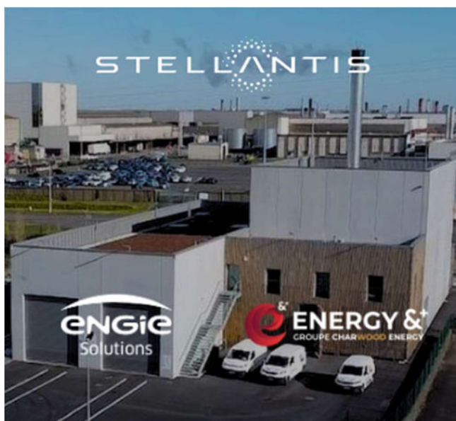
Building for the site's first biomass boiler units